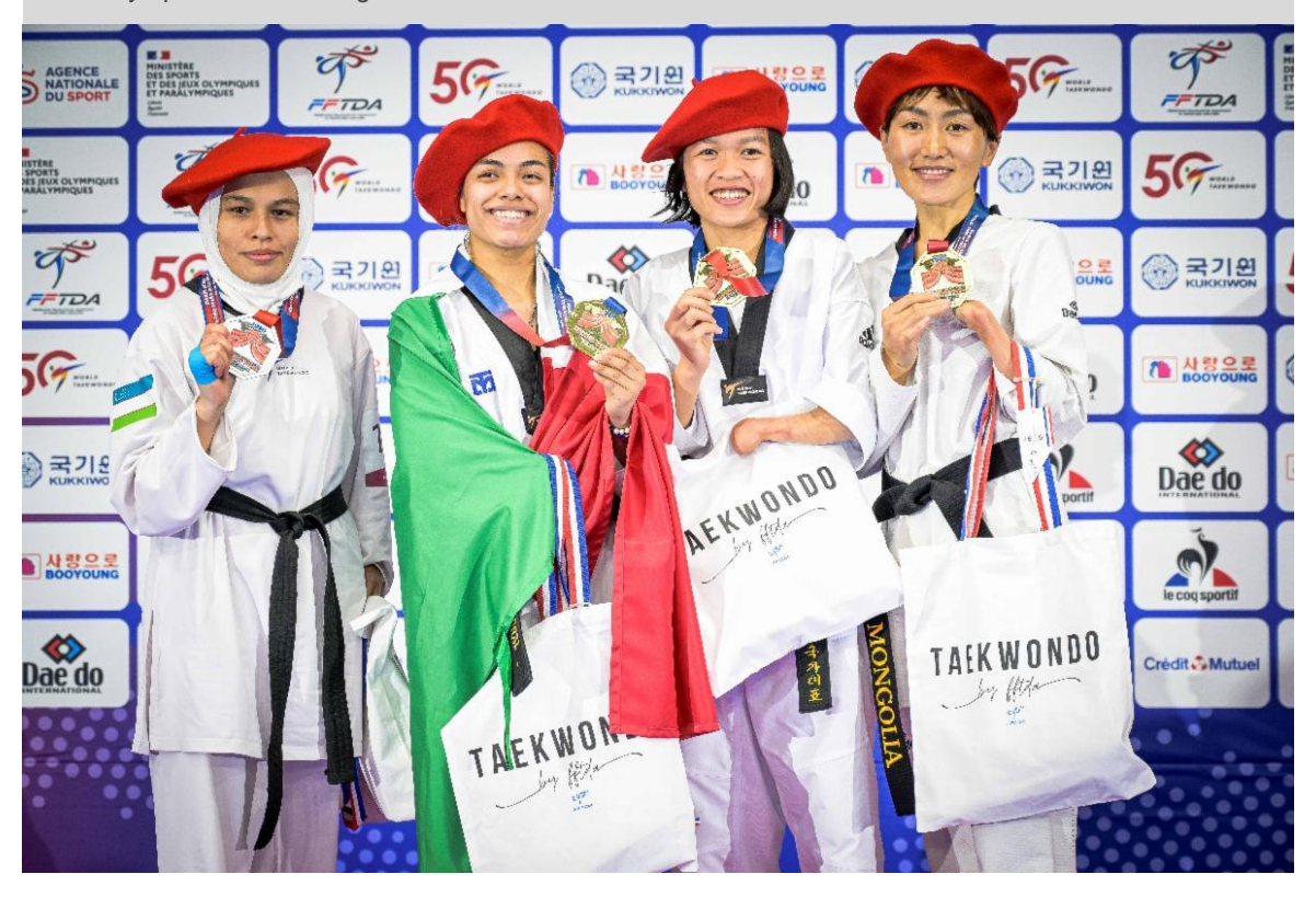
Paris hosts first Grand Prix of season

This iconic Parisian venue has a long history as a prestigious showcase for many different sporting and artistic events, and is currently undergoing work and will reopen in 2024 to host the Olympic and Paralympic Games in August 2024.