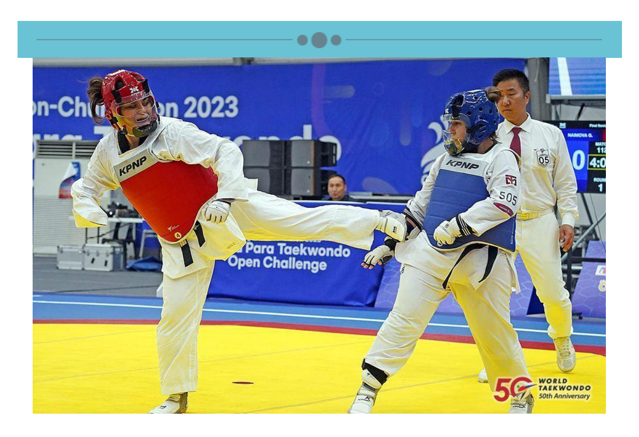
Mongolia, Uzbekistan top medals in first

"The positive aspect is that the International Federation is not relying solely on their success in Tokyo. Competitions of the highest possible standard are taking place around the world. Their delivery of services to the athletes and the development programs are also incredible. We are very impressed with the short period that we have been working with World Taekwondo."