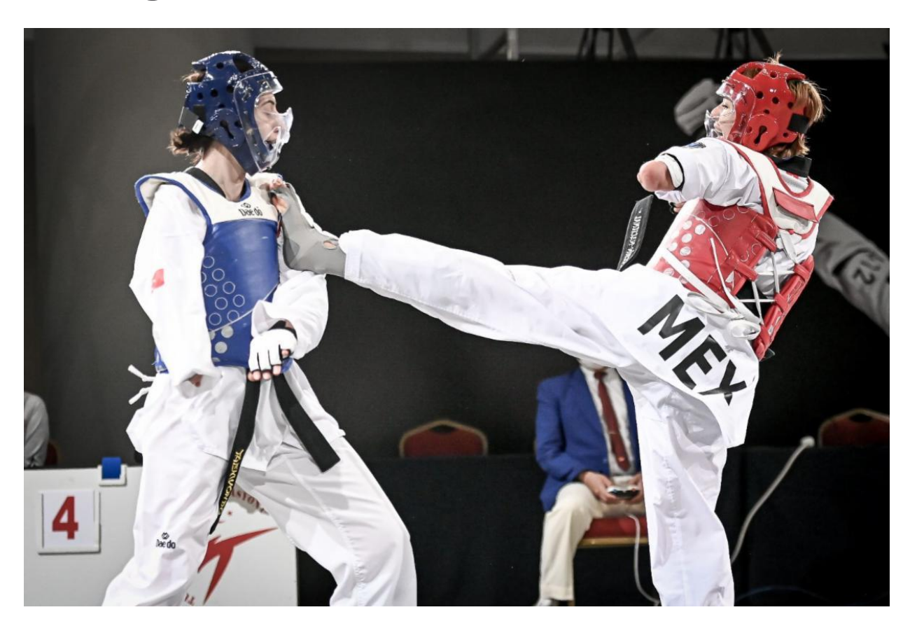
Paralympic, World champions to take centre stage